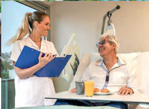
Médisud 3 by U2nc Nouméa, South Pacific